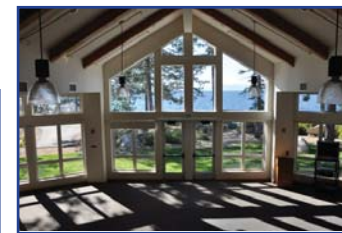
View from Inspiration Point Conference Room