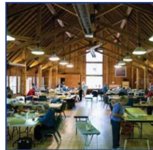
Dobbins Hall set up for Quilting Group