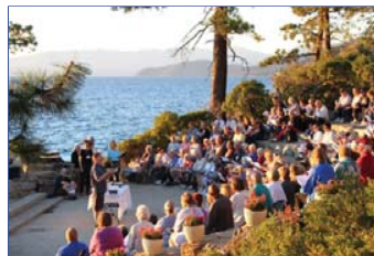
Donaldson Memorial Amphitheatre

Dobbins Hall, our largest meeting room, features historic "Old Tahoe" architecture, and comfortably seats groups of 250+ people. Donaldson Memorial Amphitheater, overlooking a spectacular view of Lake Tahoe, provides seasonal outdoor seating for 250+.